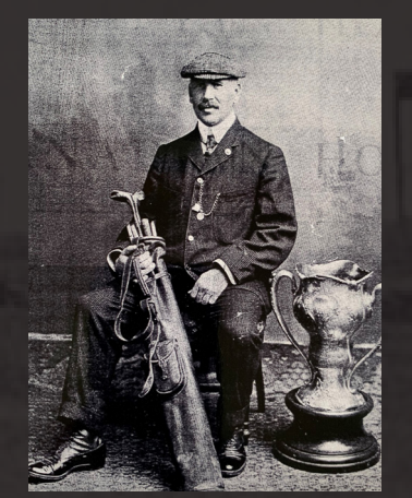
George S. Lyon with the Olympic Trophy.

runner-up at the 1910 Canadian Open, held at Lambton. Lyon was inducted into Canada's Sports Hall of Fame in 1955, the Canadian Golf Hall of Fame in 1971 and Ontario's Golf Hall of Fame in 2000. In 2015, Toronto's Sports Hall of Honour named him among its Sports Legends.